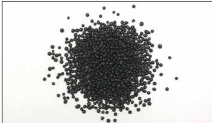
Typical Color and Pastille Form of CERANOVUS® Additives